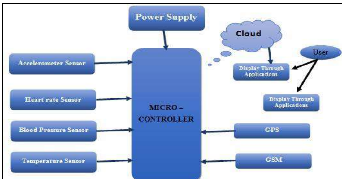
Fig 1: Block Diagram of the system

In the hardware setup different types of sensors have been used to measure the vital parameters like temperature, blood pressure, heart rate for the maternal and the movement of the fetus. Sensors are attached in the system so that it helps to take reading and it is displayed. IoT is growingly allowing to integrate devices which are capable of connecting to the Internet and provide information on the state of health of patients and provide information in real time to doctors who assist it.